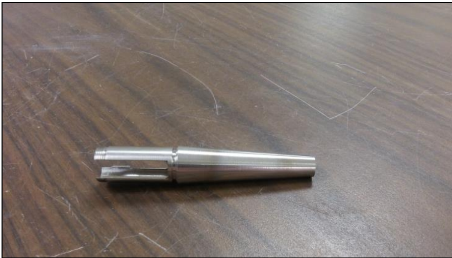
The tube after heating.